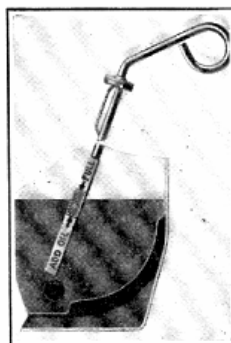
Fig. 1—Oil Depth Gauge

For convenience in maintaining the proper level, a depth gauge is provided on the engine. Access to the depth gauge is obtained by raising the flaps of the engine hood on the right side. Readings of the gauge should be taken frequently—(a convenient time being when filling up with fuel)—and oil of the correct grade added as necessary to maintain the oil level within the safe driving range marks on the gauge. To take a reading, the engine should be stopped long enough to allow all oil to drain back into the oil pan. Remove the oil depth gauge, and wipe the oil from the gauge, then re-insert the gauge to its full depth and take the